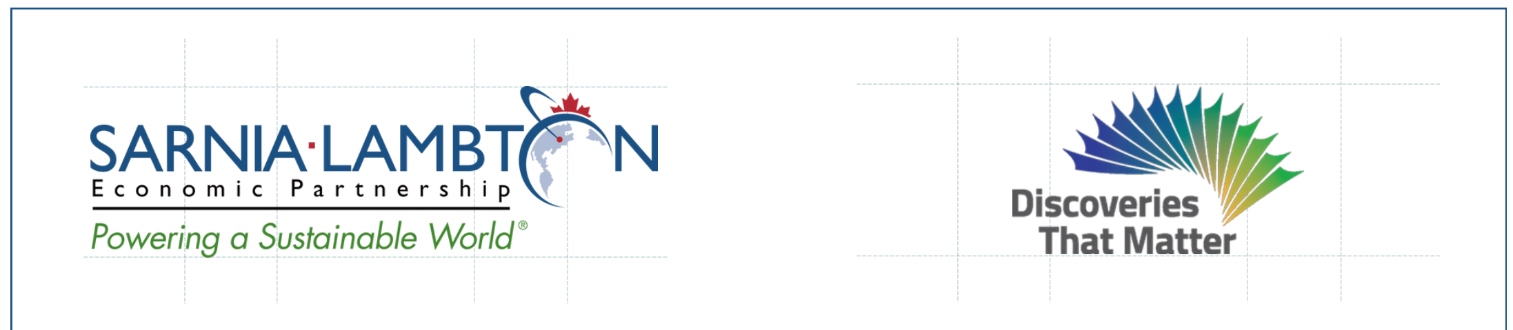
Logos displayed equal in size and appear side by side with the appropriate clear space between both logos.